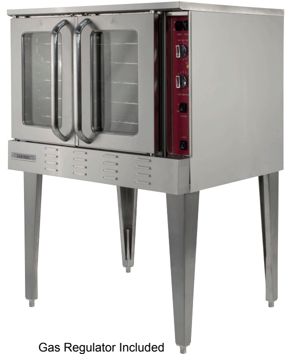
Gas Regulator Included

Kintera Gas Cooking Equipment is warranted to be free from defects in material and workmanship under normal use and service for a period of 1 year from the date of original purchase.