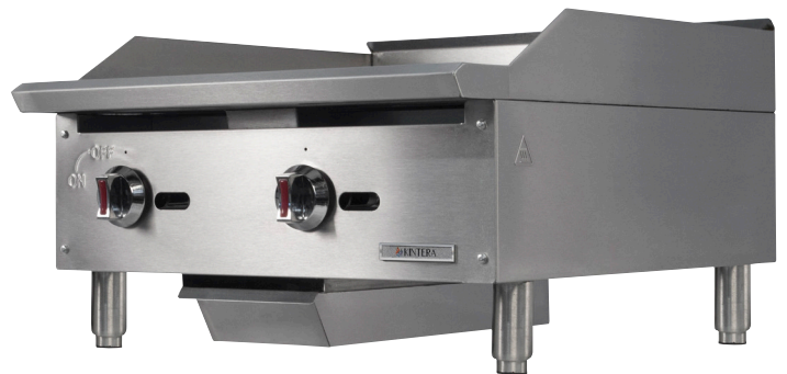
KGR24M Gas Regulator Included

Kintera Gas Cooking Equipment is warranted to be free from defects in material and workmanship under normal use and service for a period of 1 year from the date of original purchase.