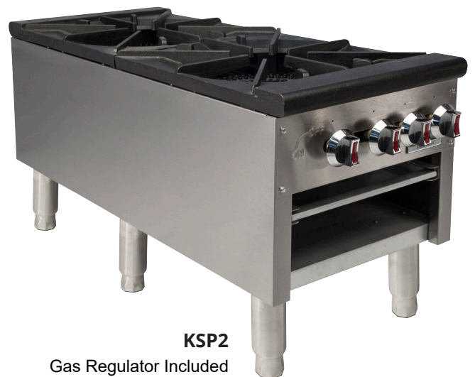
KSP2 Gas Regulator Included

Kintera Gas Cooking Equipment is warranted to be free from defects in material and workmanship under normal use and service for a period of 1 year from the date of original purchase.