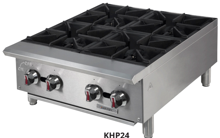
KHP24 Gas Regulator Included

All Countertop Gas Ranges carry ETL gas and sanitation approvals that meet US gas and sanitation requirements for use in restaurants.