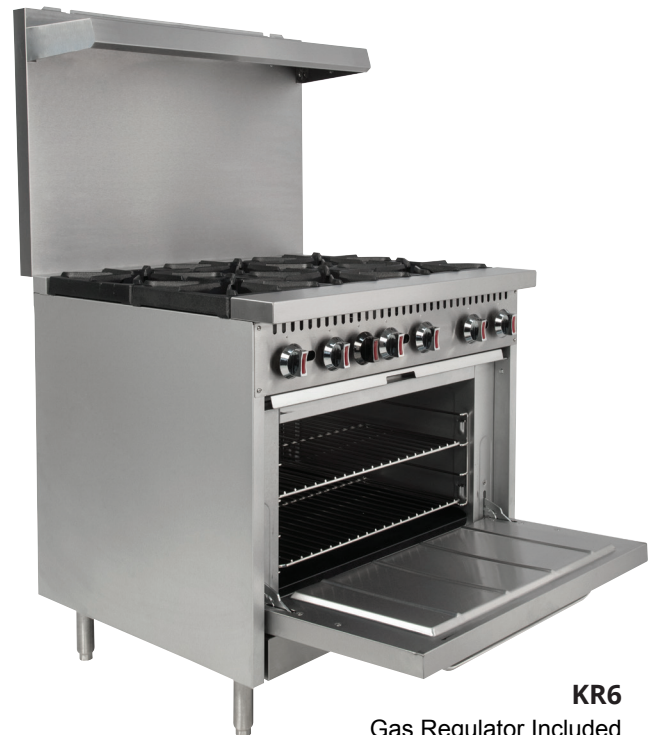
KR6 Gas Regulator Included

Kintera Gas Cooking Equipment is warranted to be free from defects in material and workmanship under normal use and service for a period of 1 year from the date of original purchase.