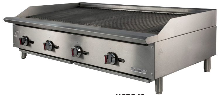
KCBR48 Gas Regulator Included

Kintera Gas Cooking Equipment is warranted to be free from defects in material and workmanship under normal use and service for a period of 1 year from the date of original purchase.