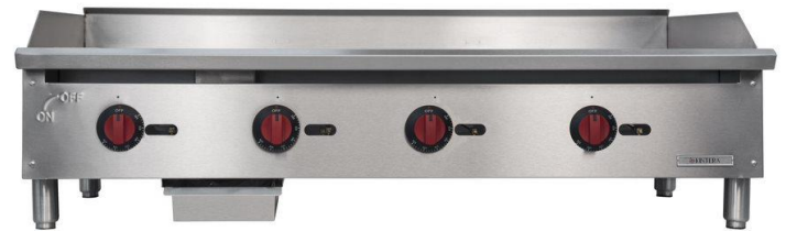
KGR48T Gas Regulator Included

Kintera Gas Cooking Equipment is warranted to be free from defects in material and workmanship under normal use and service for a period of 1 year from the date of original purchase.