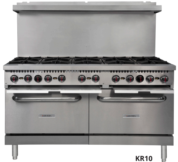
KR10 Gas Regulator Included

Kintera Gas Cooking Equipment is warranted to be free from defects in material and workmanship under normal use and service for a period of 1 year from the date of original purchase.