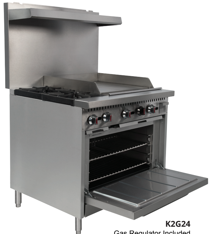
K2G24 Gas Regulator Included